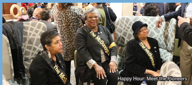
Happy Hour: Meet the Pioneers

The United States Marshals Museum (USMM) is committed to serving a large and diverse audience of those seeking to learn more about justice, integrity, and service through stories of the U.S. Marshals Service (USMS), the U.S. Constitution, and the Rule of Law.