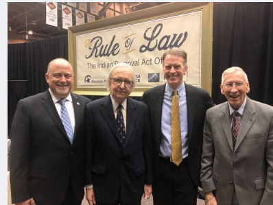
Steve Inskeep from NPR discussed his book Jacksonland at the 2018 event, The Rule of Law: The Indian Removal Act of 1830 .