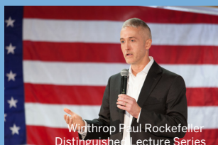
Winthrop Paul Rockefeller Distinguished Lecture Series