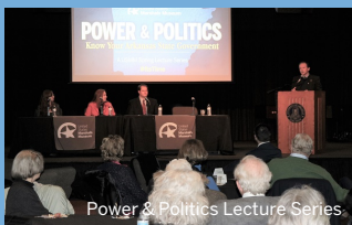
Power & Politics Lecture Series