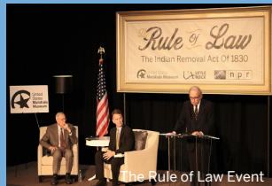
The Rule of Law Event