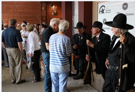
A Little Courage, A Lot of Grit event held in 2019 educated guests on the connection between Oklahoma, Arkansas, and the U.S. Marshals.