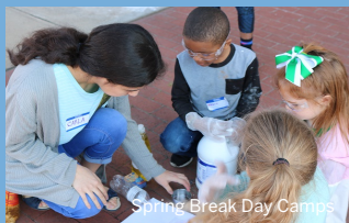
Spring Break Day Camps