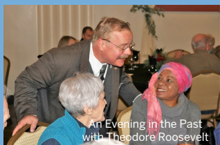
An Evening in the Past with Theodore Roosevelt