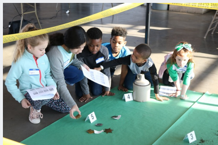
Students worked to solve the case of the missing artifacts at the 2019 Spring Break Camp.

Contact the Museum at (479) 242-1789 or by email at info@usmmuseum.org